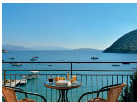
Romvi Hotel, Tolon

Palm Trees Hotel, Lefkas (page 37): "A quality holiday based in tasteful accommodation in a great location. Hotel owners' lovely people who go out of their way to make you feel welcome. Spacious balcony with sea view. Would use Sunvil again based on our experience."