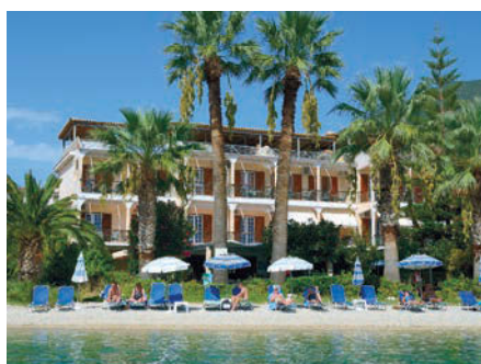
Palm Trees Hotel, Lefkas