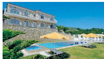
Villa Penny, Samos

Trusted customer review by Bill: "Romvi Hotel and Restaurant exceeded expectations. The room was spacious, clean, comfortable and well-equipped. Meals in the restaurant were excellent, and superb value for money. The staff - all of them - were welcoming, friendly and helpful. I would certainly return here."